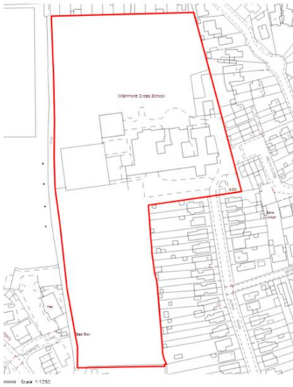
Site layout plan