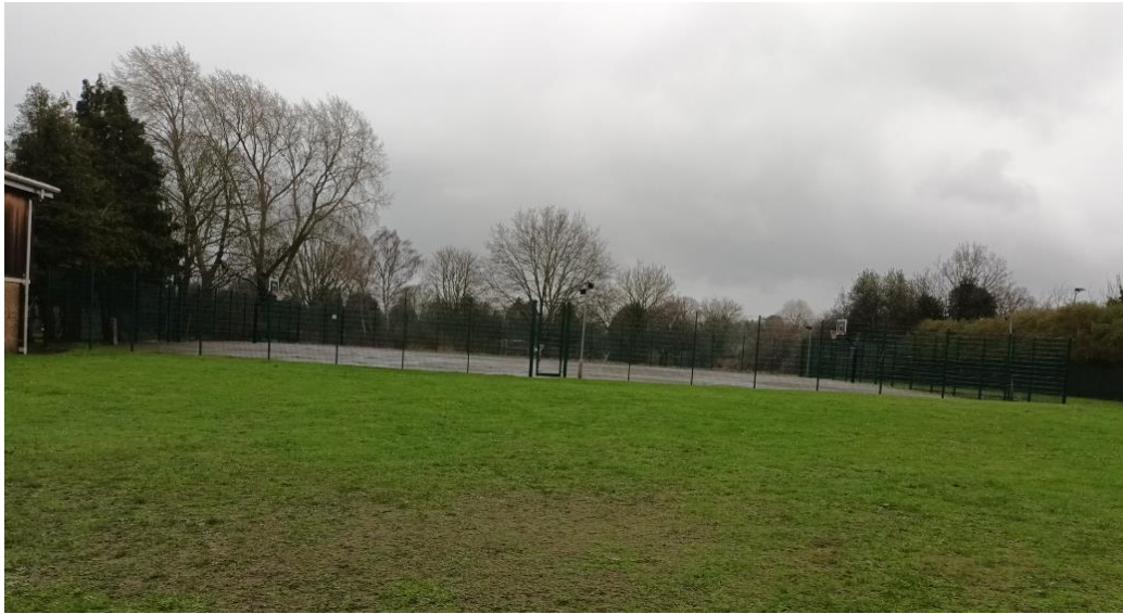
Existing fence and gate to the western side