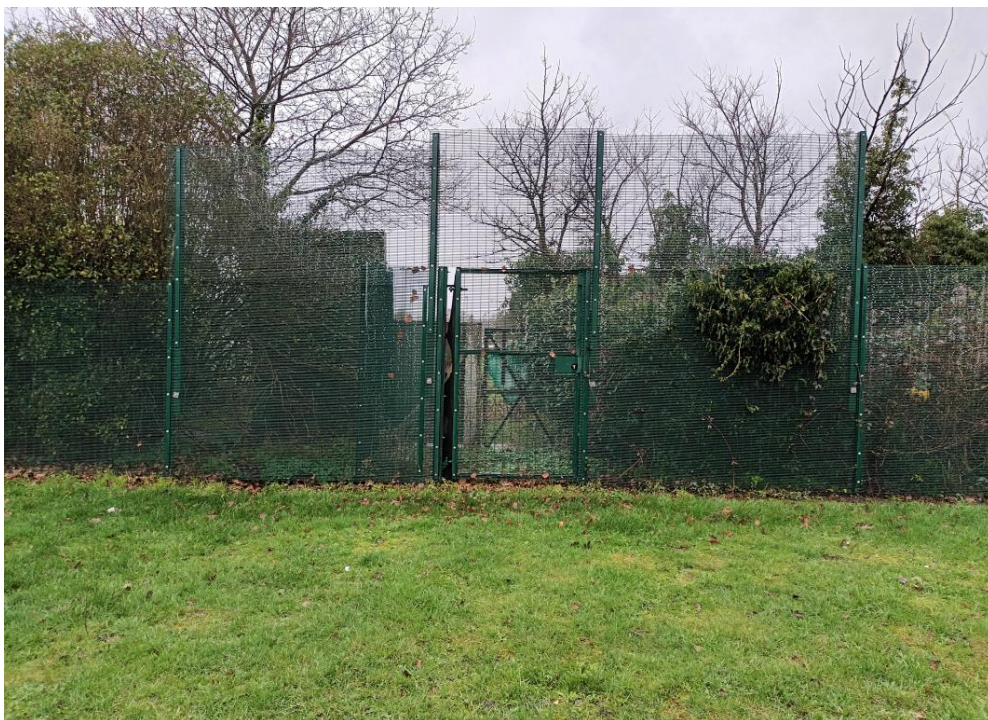
Image of the existing boundaries along the northern side