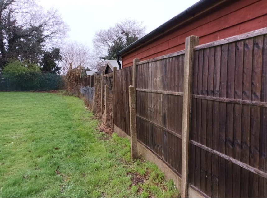
The existing eastern and northern border of the site