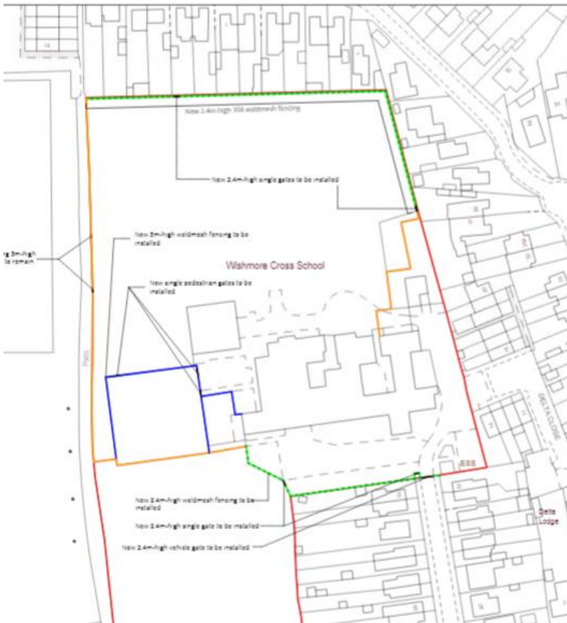
Elevations of proposed fence